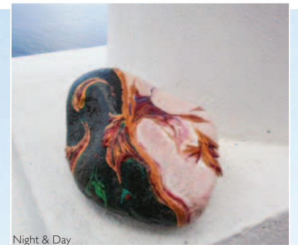
Night & Day

Italian Renaissance Colours - Autumn Still Colours