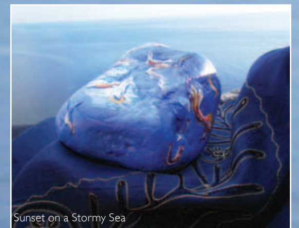
Sunset on a Stormy Sea